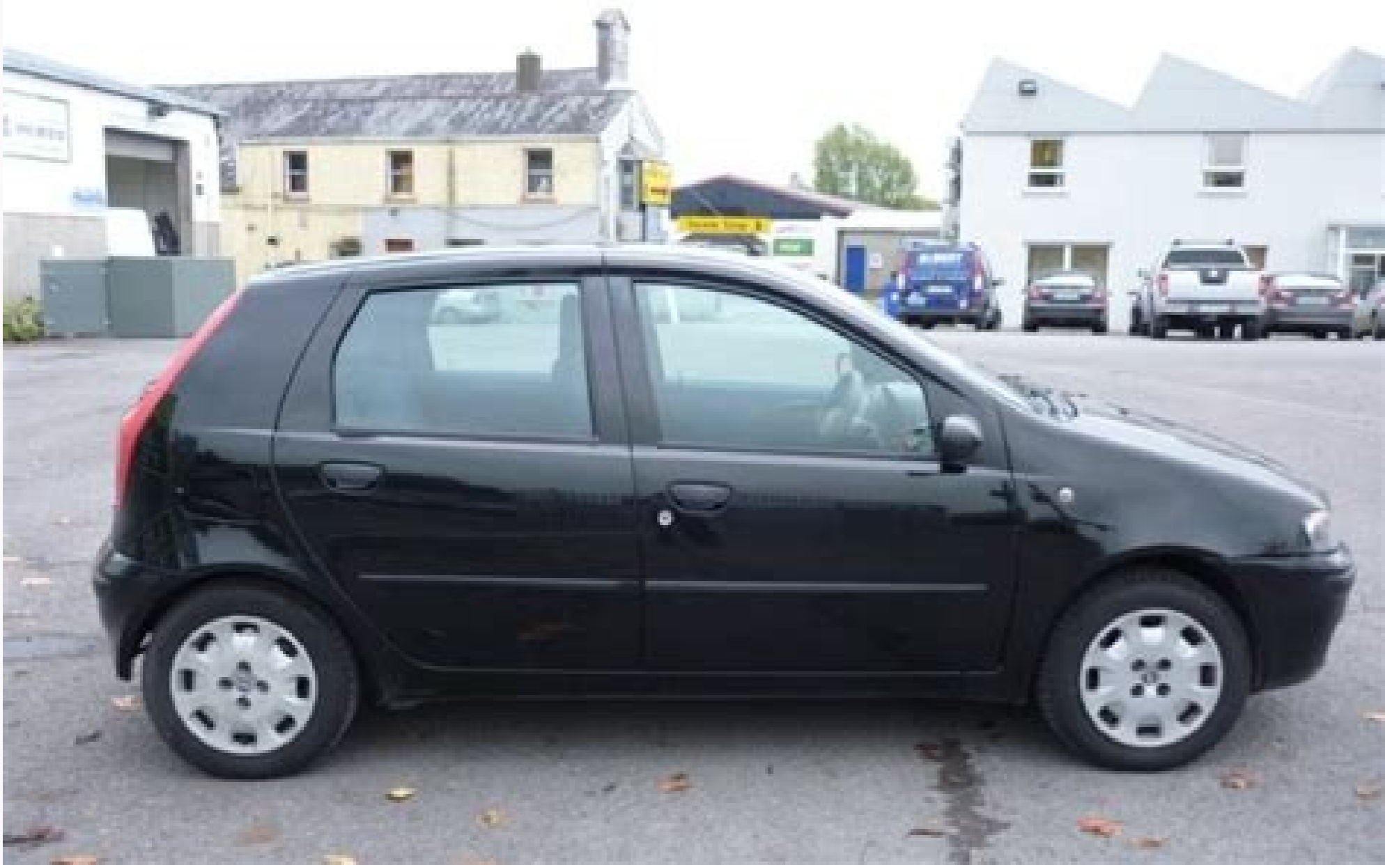
Fiat grande punto 2008 manual.